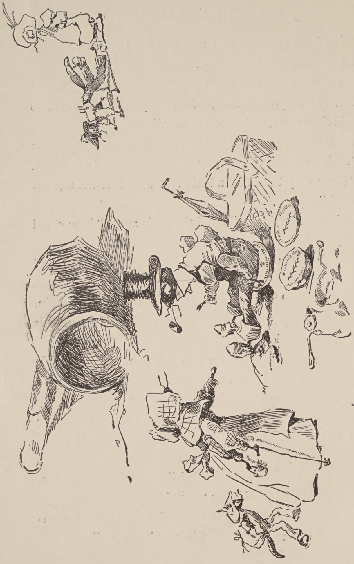
THE ANT'S UNCLE THINKS THE CUSTARD PIE IS A CUSHION.